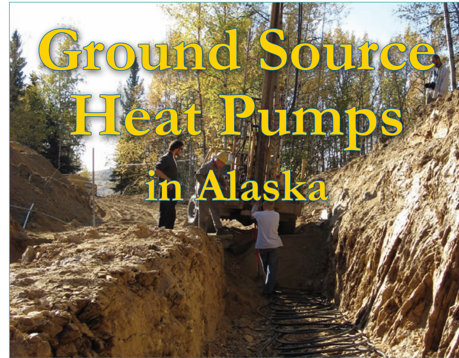
Technicians prepare to install "slinky coils," a type of horizontal closed-loop system, at Weller Elementary School in Fairbanks.