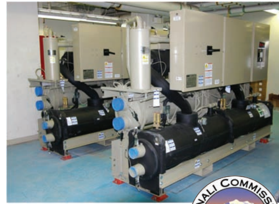
Heat pump units installed and ready for connections.

The Alaska SeaLife Center is Alaska's only public aquarium, located on the shores of Resurrection Bay. With recent escalations in heating oil costs, the SeaLife Center is motivated to reduce its monthly operational expenses by considering heat production methods that are more cost effective than direct use of heating oil. In addition, the SeaLife Center is interested in reducing its current production of greenhouse gas (CO 2 ) as part of the greater mission to preserve and protect the fragile marine environment of Alaska.