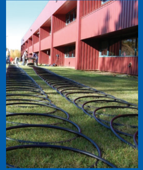
Weller Elementary School, Fairbanks.

Heat pump technology is used widely in the Lower 48 and around the globe; however, there are limited installations in cold climates. While little is known about the effectiveness of this technology in Alaska, given the high heating costs statewide it is worth investigating to determine if it makes technical and economic sense.