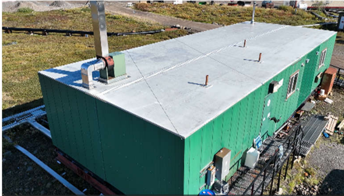
Aerial view of Wet Lab roof to illustrate multiple roof penetrations and curb details required around exhaust duct work.