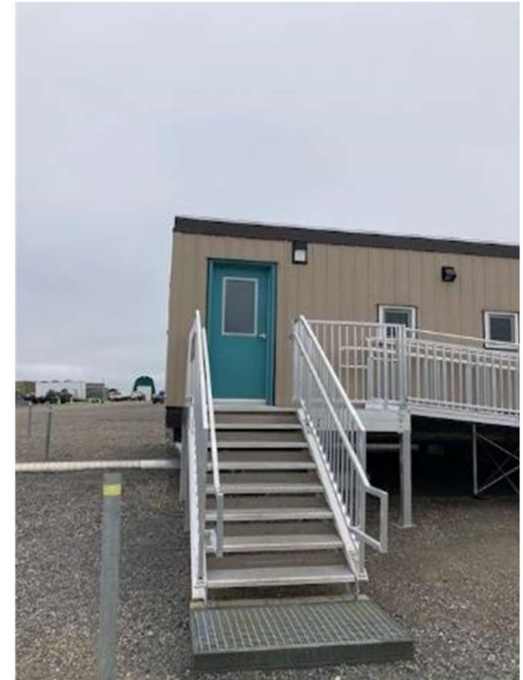
One of two Washeteria entrances to receive a