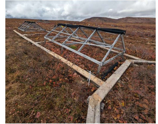
Example of Griffin LTER boardwalk to be inspected and repaired. Also pictured are greenhouse structures that will be deconstructed and removed.