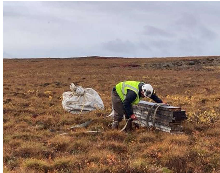
FEMC crew member prepares boardwalk to be removed via helicopter.