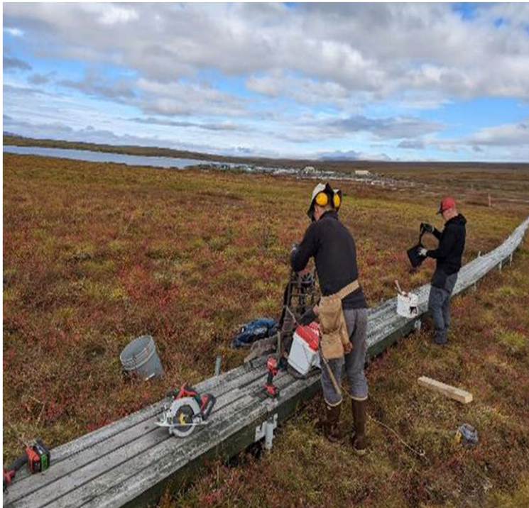
FEMC crews making annual repairs to a section of boardwalk near Toolik Field Station.