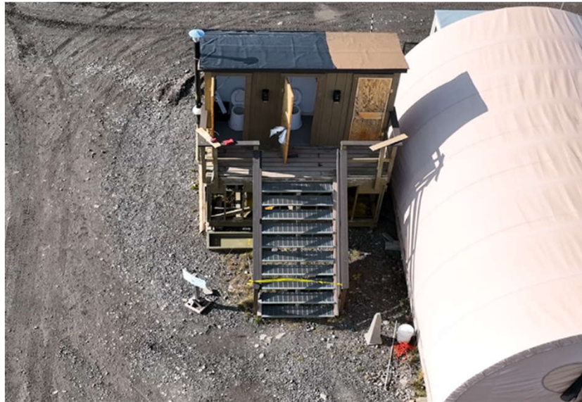
Aerial view of existing Tent City outhouse tower.