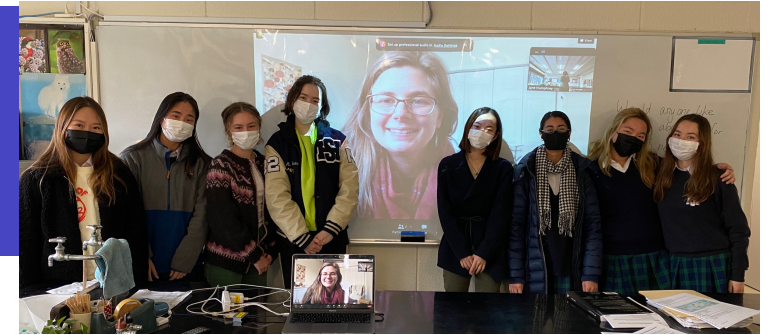
Skype-a-Scientist session with an environmental science class at an all girls high school in Japan