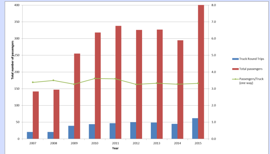
Including DHE in 2016