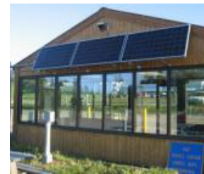
Newly installed solar panels on the Nenana bus shelter

http://www.gvea.com/alternative-energy/snap/