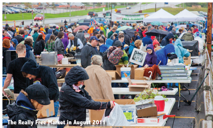
The Really Free Market in August 2011

In 2009, the Really Free Market began as the ultimate recycling event. Working with volunteers across campus, this Saturday event became an instant hit in the Fairbanks community. The success brought a decision to have two each summer, one in June as well as August. This year a third event was added in early October directly aimed at students. Hundreds of students came to Wood Center to get warm clothing, household goods and sporting equipment. Volunteers from the STRIVE and Alpha Phi Omega organizations assisted to make this event a success that will be repeated in the years to come.