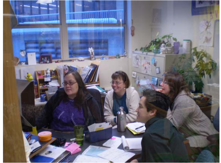
RSS advisors reviewing grades

If you were on financial aid probation, your grades and academic record were reviewed during winter break. If you did not meet SAP your financial aid eligibility for Spring 2009 will be affected.