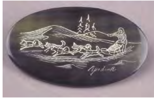
Scrimshaw on Baleen by Harry Apodruk Burke Museum Collections, 1999-97/205