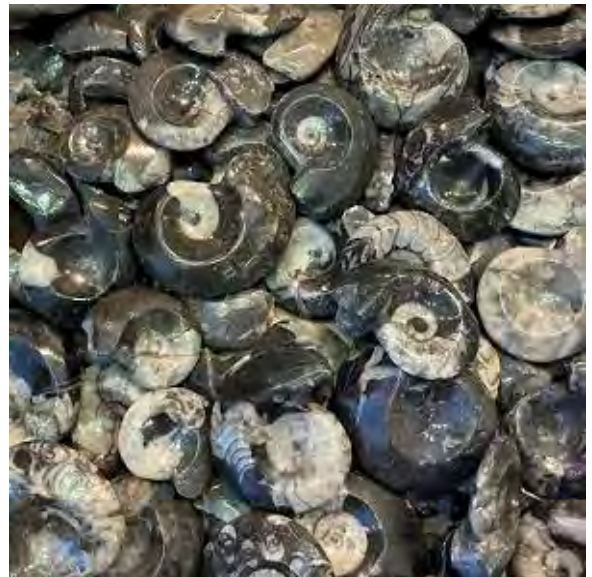
Ammonites Museum Store