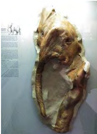
Baby Mammoth Mammuthus primigenius Gallery of Alaska: Interior