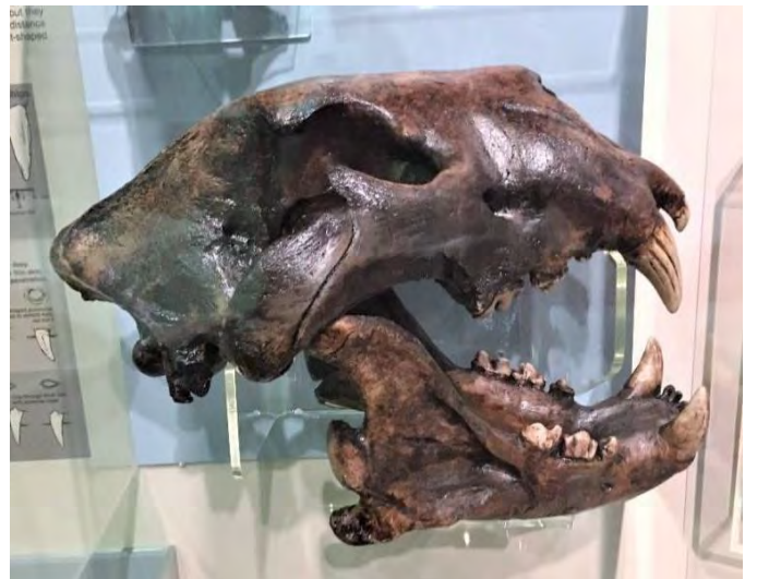
Beringian Lion Panthera leo spelaea Gallery of Alaska: Interior