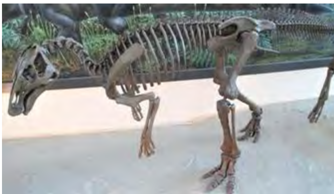
Cast of an Ugrunaaluk kuukpikensis skeleton

Discover paleo art in the museum! Explore artists such as James Havens , Randall Compton , and Ray Troll . Take a deeper dive into paleo art with a video by the Field Museum: Paleoart: Painting the Land Before Time .