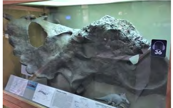
Pachyrhinosaur Gallery of Alaska: Western Arctic Coast