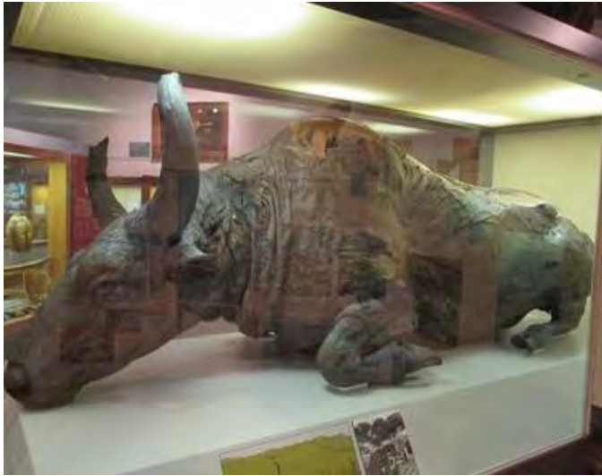
Steppe Bison Bison priscus Gallery of Alaska: Interior