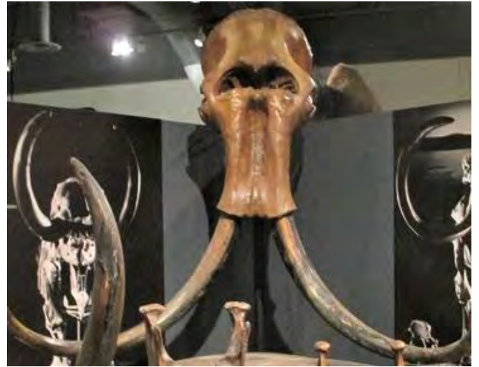
Woolly Mammoth Mammuthus primigenius Gallery of Alaska