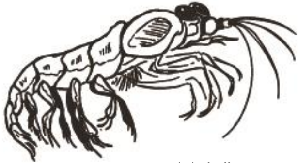
English: krill Iñupiaq: igliġat St. Lawrence Island Yupik: kemegtungingestaq