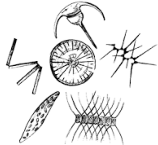
English: phytoplankton Iñupiaq: nauriagurat St. Lawrence Island Yupik: kingungestaq