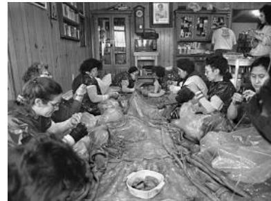
Women in Utqiagvik sew bearded seal skins for an umiak cover.

Walrus or bearded seal ( ugruk ) hides make a light, waterproof cover for an umiak. It takes five to seven bearded seal or walrus skins to cover the frame! The hides are replaced every two to four years. Sewing the hides together is a social event, with the whole community participating.