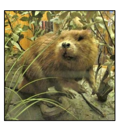
Beaver [Castor canadensis]