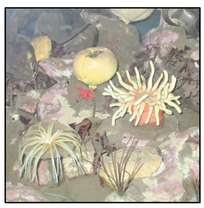
Model of Beaufort Sea Boulder Patch, with multiple species.