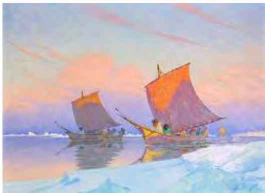
Two Umiaks Under Sail

by Magnus (Rusty) Heurlin, UA2003-023-001