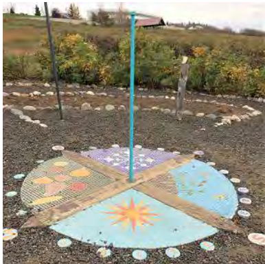
Sundial at the Georgeson Botanical Gardens.

ankn.uaf.edu/curriculum/Athabascan/ObservingSnow/fourcorners.html