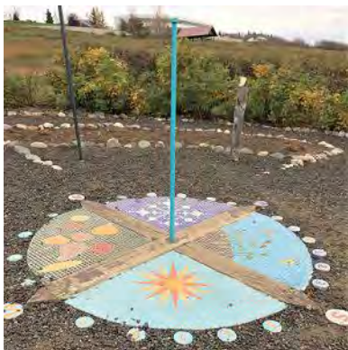
Sundial at the Georgeson Botanical Gardens.

ankn.uaf.edu/curriculum/Athabascan/ObservingSnow/fourcorners.html