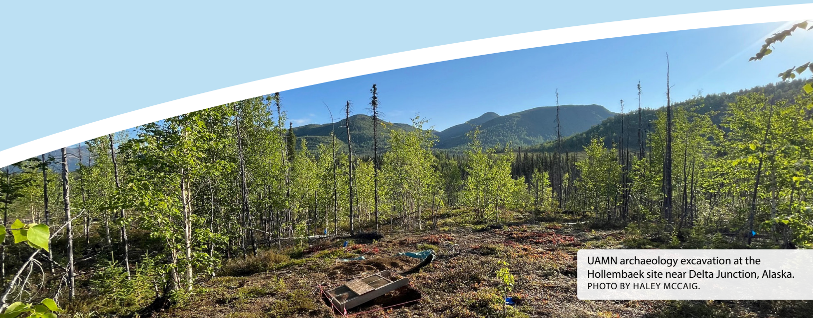
UAMN archaeology excavation at the Hollembaek site near Delta Junction, Alaska.