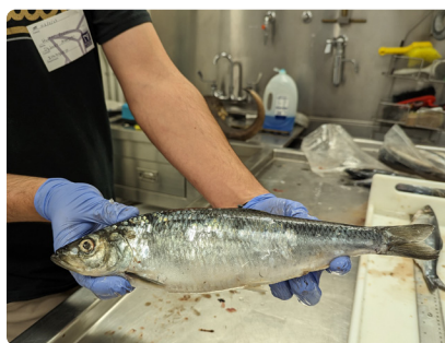
Pacific Herring from the Bering Sea.