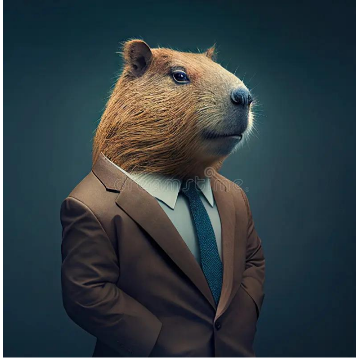
Figure 3.1: A capybara wearing a suit. Probably has an important meeting to get to.

Lorem ipsum dolor sit amet, consectetur adipiscing elit. Ut purus elit, vestibulum ut, placerat ac, adipiscing vitae, felis. Curabitur dictum gravida mauris. Nam arcu libero, nonummy eget, consectetur id, vulputate a, magna. Donec vehicula augue eu neque. Pellentesque habitant morbi tristique senectus et netus et malesuada fames ac turpis egestas. Mauris ut leo. Cras viverra metus rhoncus sem. Nulla et lectus vestibulum urna fringilla ultrices. Phasellus eu tellus sit amet tortor gravida placerat. Integer sapien est, iaculis in, pretium quis, viverra ac, nunc. Praesent eget sem vel leo ultrices bibendum. Aenean faucibus. Morbi dolor nulla, malesuada eu, pulvinar at, mollis ac, nulla. Curabitur auctor semper nulla. Donec varius orci eget risus. Duis nibh mi, congue eu, accumsan eleifend, sagittis quis, diam. Duis eget orci sit amet orci dignissim rutrum. Mauris ut leo. Cras viverra metus rhoncus sem. Nulla et lectus vestibulum urna fringilla ultrices. Phasellus eu tellus sit amet tortor gravida placerat. Integer sapien est, iaculis in, pretium quis, viverra ac, nunc. Praesent eget sem vel leo ultrices bibendum. Lorem ipsum dolor sit amet, consectetur adipiscing elit. Ut purus elit, vestibulum ut, placerat ac, adipiscing vitae, felis. Curabitur dictum gravida mauris. Nam arcu libero, nonummy eget, consectetur id, vulputate a, magna.