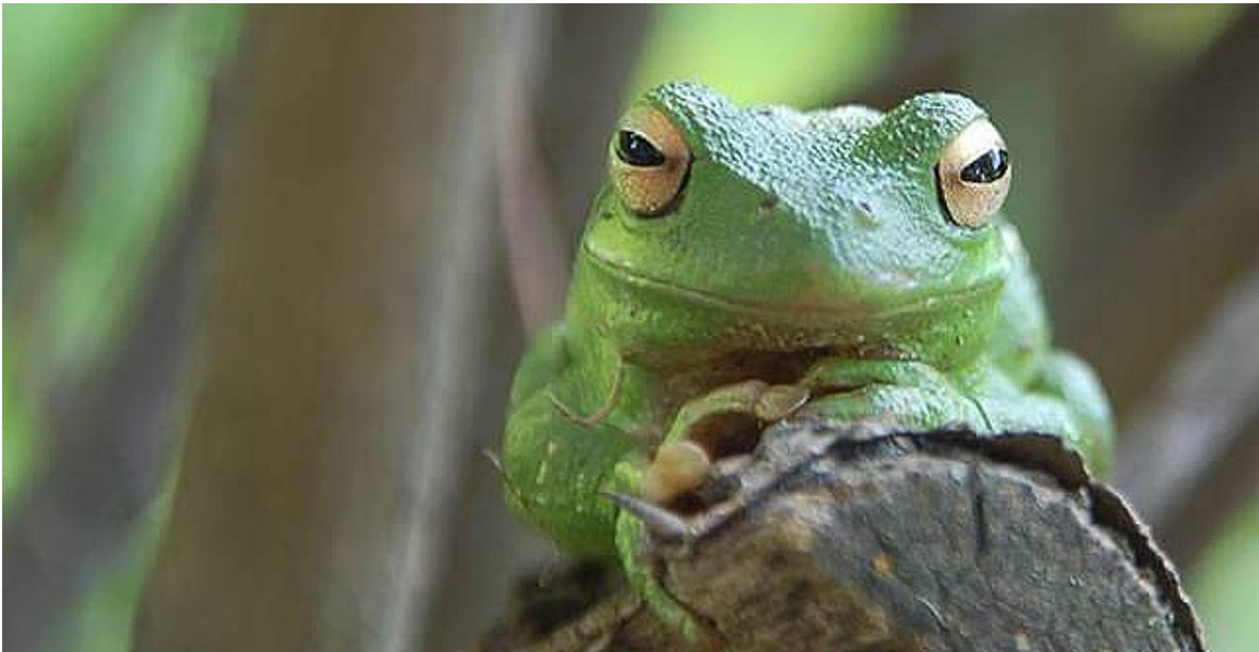
Figure A.1: Frog looking real dapper.

Nulla malesuada porttitor diam. Donec felis erat, congue non, volutpat at, tincidunt tristique, libero. Vivamus viverra fermentum felis. Donec nonummy pellentesque ante. Phasellus adipiscing semper elit. Proin fermentum massa ac quam. Sed diam turpis, molestie vitae, placerat a, molestie nec, leo. Maecenas lacinia. Nam ipsum ligula, eleifend at, accumsan nec, suscipit a, ipsum. Morbi blandit ligula feugiat magna. Nunc eleifend consequat lorem. Sed lacinia nulla vitae enim. Pellentesque tincidunt purus vel magna. Integer non enim. Praesent euismodnunc eupurus. Donec bibendumquam in tellus. Nullamcursus pulvinar lectus. Donec et mi. Nam vulputate metus eu enim. Vestibulum pellentesque felis eu massa.