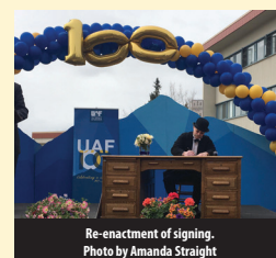
Re-enactment of signing.