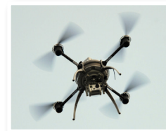
An unmanned aircraft makes a test run.

UAF's unmanned aircraft program recently received a generous gift of two Cloud Cap TASE 300 imaging systems valued at $190,000 from UTC Aerospace Systems. The new cameras will support research at the Alaska Center for Unmanned Aircraft Systems Integration (ACUASI) at the Geophysical Institute. Unmanned aircraft are able to observe and collect data from areas that are dangerous or impossible to reach by manned aircraft. "The emphasis on unmanned aircraft operations in the northern latitudes is of increasing importance, and partnerships such as this help to expand UAF's capabilities," said ACUASI Director Marty Rogers. UAF was recently named one of six unmanned aircraft system test sites by the Federal Aviation Administration. The FAA designation highlights UAF's role as a premier research facility and will support a broad range of studies, including environmental observation and monitoring, marine mammal research, mapping, and search and rescue missions. The team conducts research missions here and across the globe.