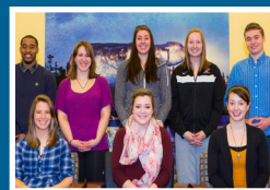
2013-14 UAF student callers.

Save the date. The 2014 Donor Recognition Event will take place on Nov. 20 at 5:30 p.m. at UAF.