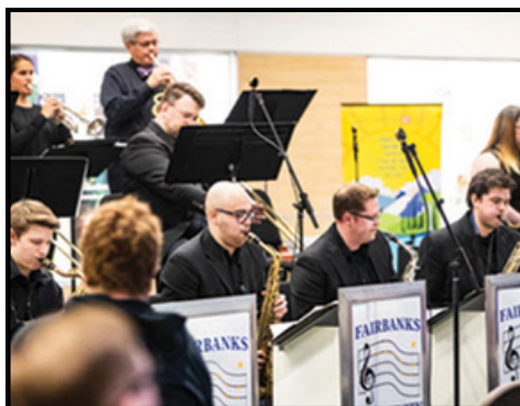
Fairbanks Community Jazz Band at 7:30pm