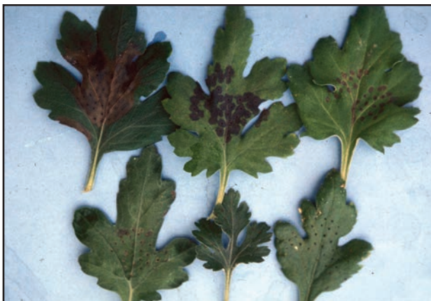
Pseudomonas (bacterial leaf spot) on chrysanthemums