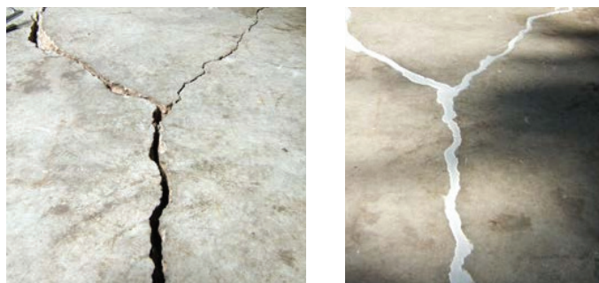
Cracks in the foundation, before (left) and after (right) sealing.

Start with the simplest changes and work up to the more complicated and expensive methods. Sealing cracks and other openings in the foundation is the simplest way to limit radon's entrance into the house. Put a high-density plastic sheet (6 mil or thicker) on the ground, overlapping seams for complete cover-