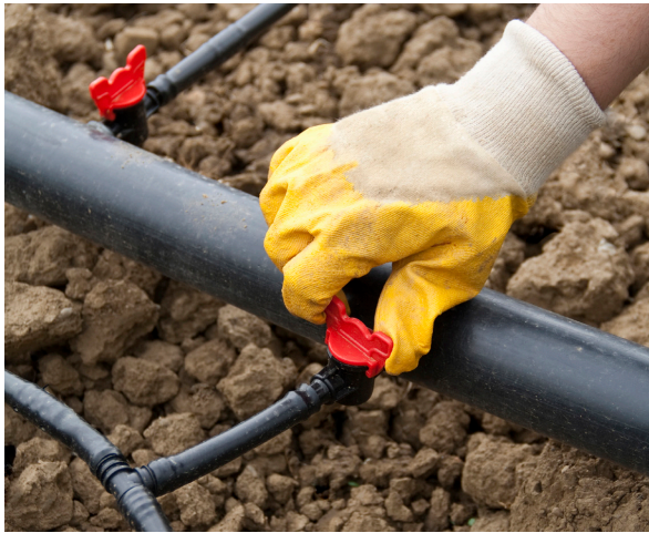
Drip irrigation is easily adaptable to most garden areas. Additional shut-off valves can be added for each emitter line for more control in irrigation application.

row crops and greenhouses. It is a porous tube with a series of equally spaced holes or small openings. The flow rate is typically given as gallons per hour (gph) and ranges from 0.1–2 gph per 100 feet of line. On level ground, lines can be up to 300 feet. The operating pressure is low and ranges from 2–30 pounds per square inch (psi); any change in elevation causes large variation in flow rates.