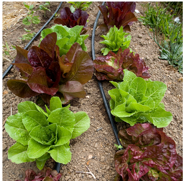
Line-source emitter tubing with equally spaced built-in emitters is ideal for irrigating garden crops planted at regular spacing, such as head lettuce.