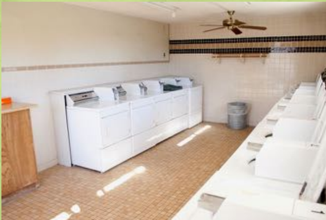
An Apartment Building Laundry Room