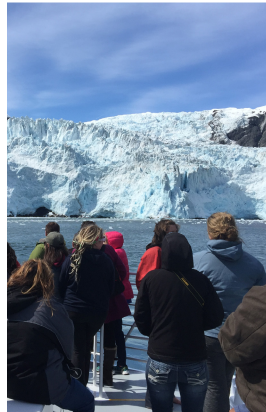
Students tour Kenai Fjords as part of a field tour focus on tourism.

"Students will have greater options down the road," he said.