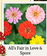
All's Fair in Love & Spore