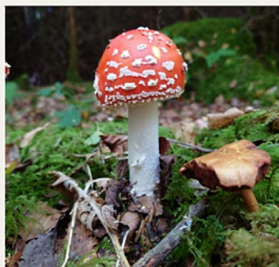
First Prompt January 2026!

THE TANANA DISTRICT 4-H LEADERS COUNCIL IS HOSTING A 10- THEME, PHOTO SCAVENGER HUNT FOR 4-H MEMBERS IN THE TANANA DISTRICT.