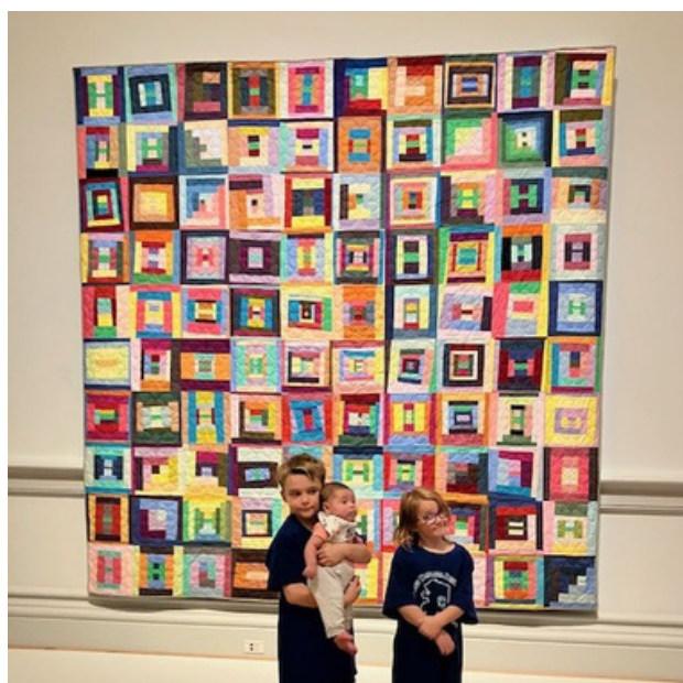
Log Cabin Quilt