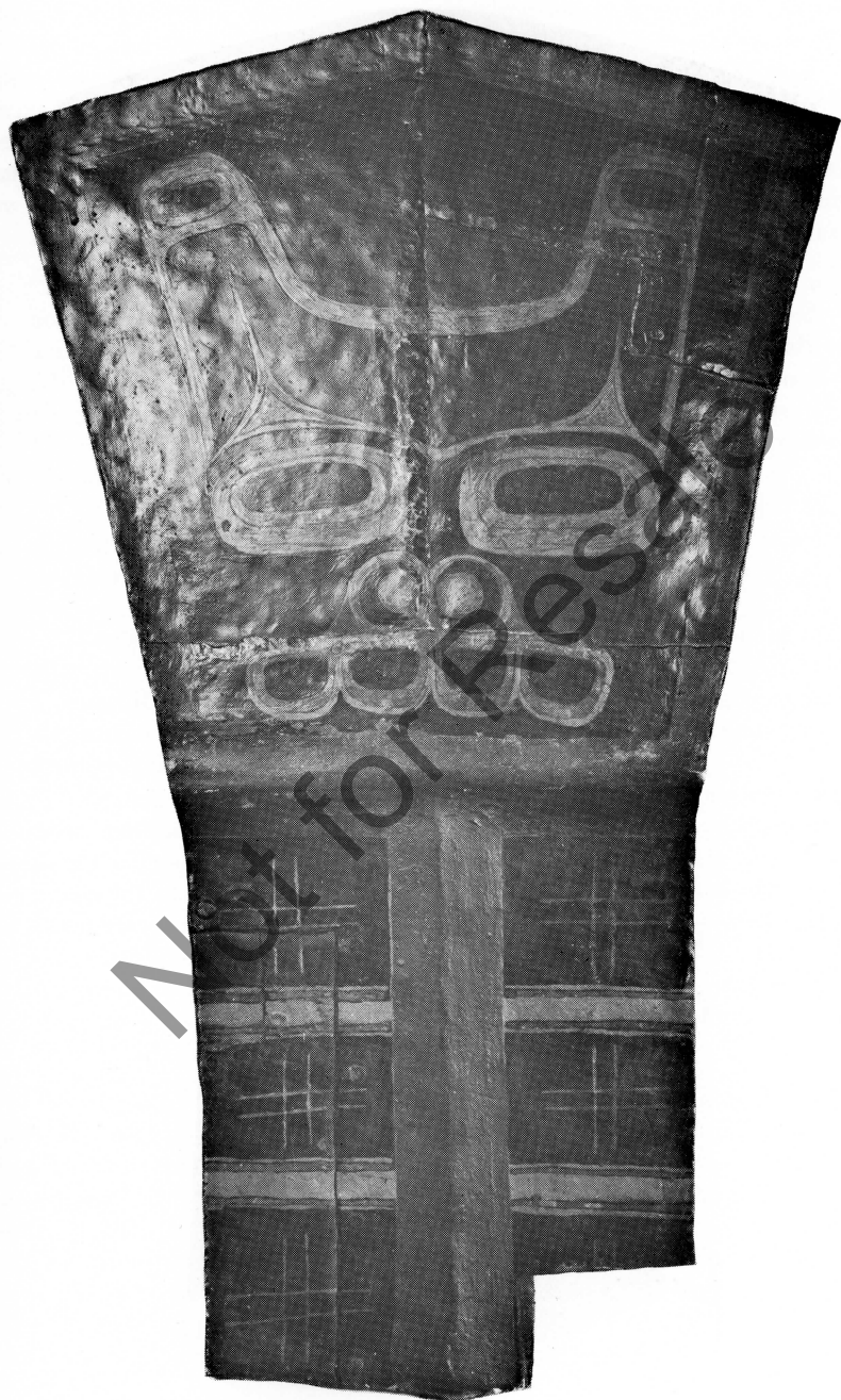
Plate VIII. Museum of Anthropology, University of British Columbia.