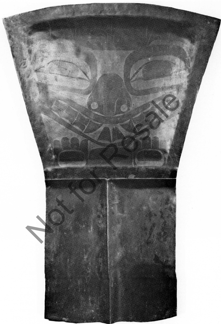
Plate III. Museum of Anthropology, University of British Columbia.