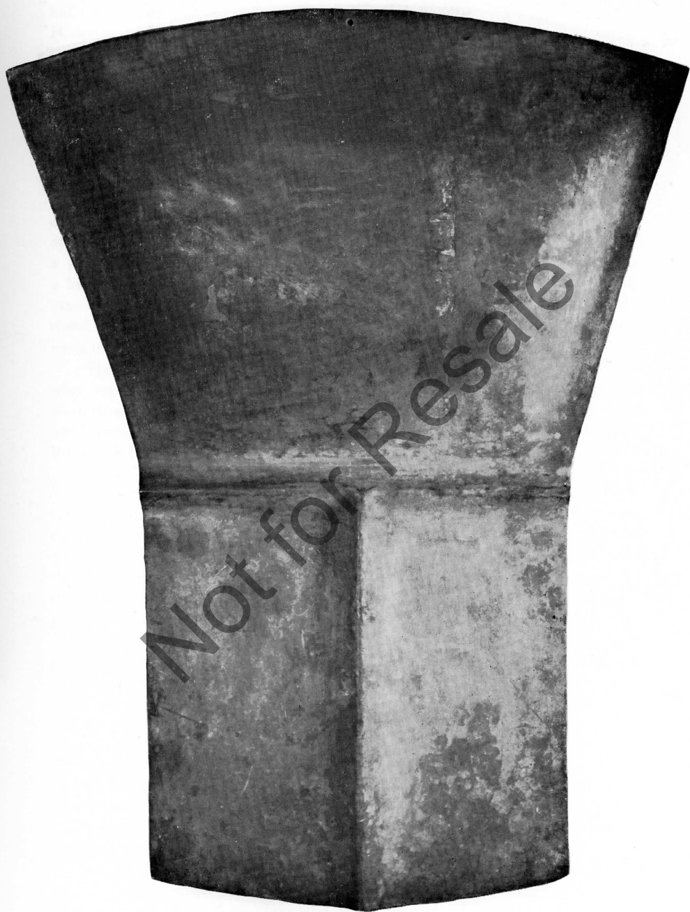
Plate II. Denver Art Museum.