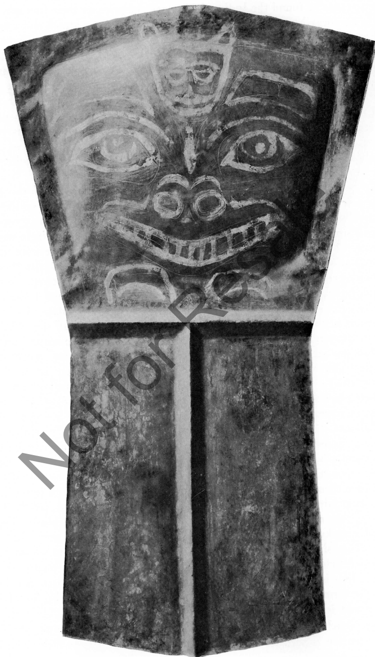
Plate VII. The Royal Ontario Museum, Canada.