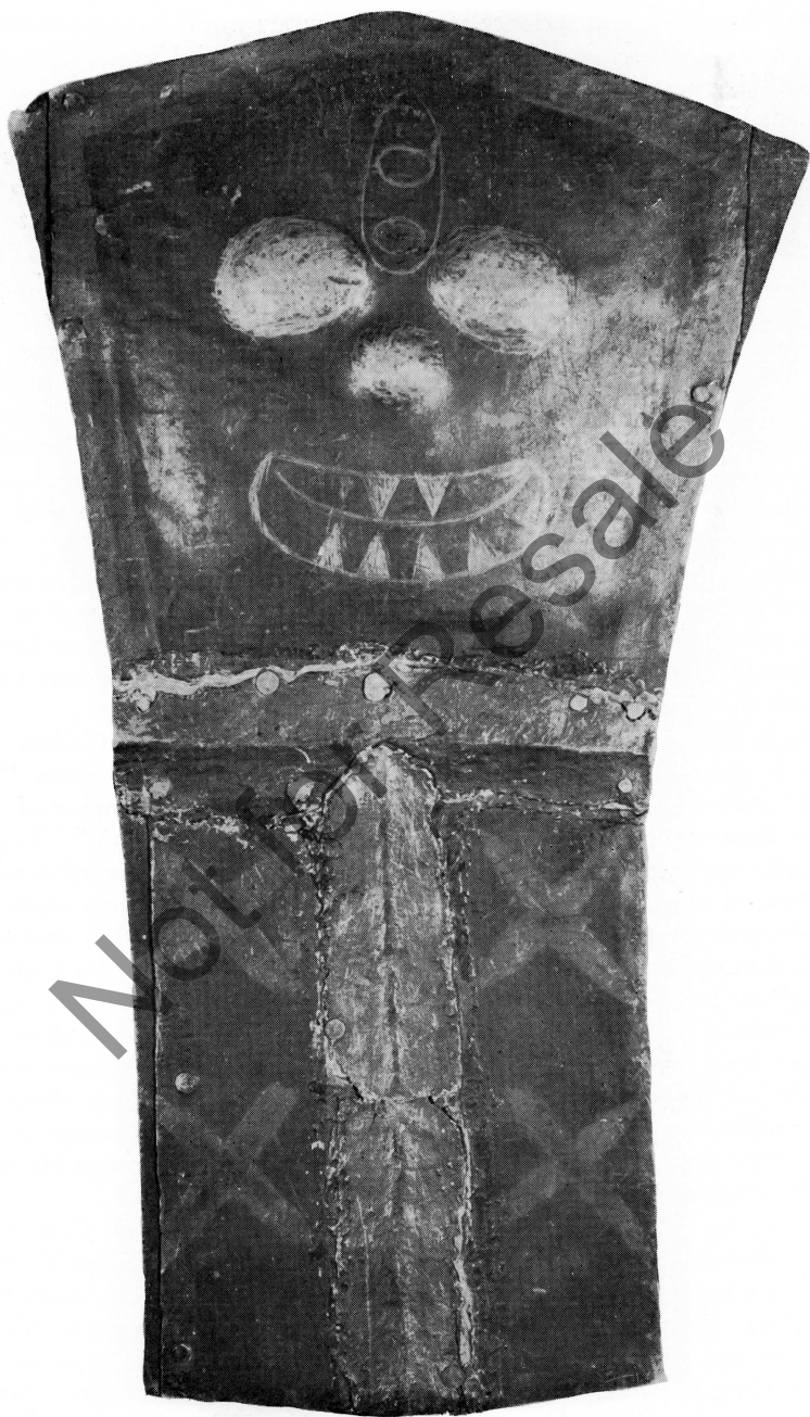
Plate IV. Museum of Anthropology, University of British Columbia.