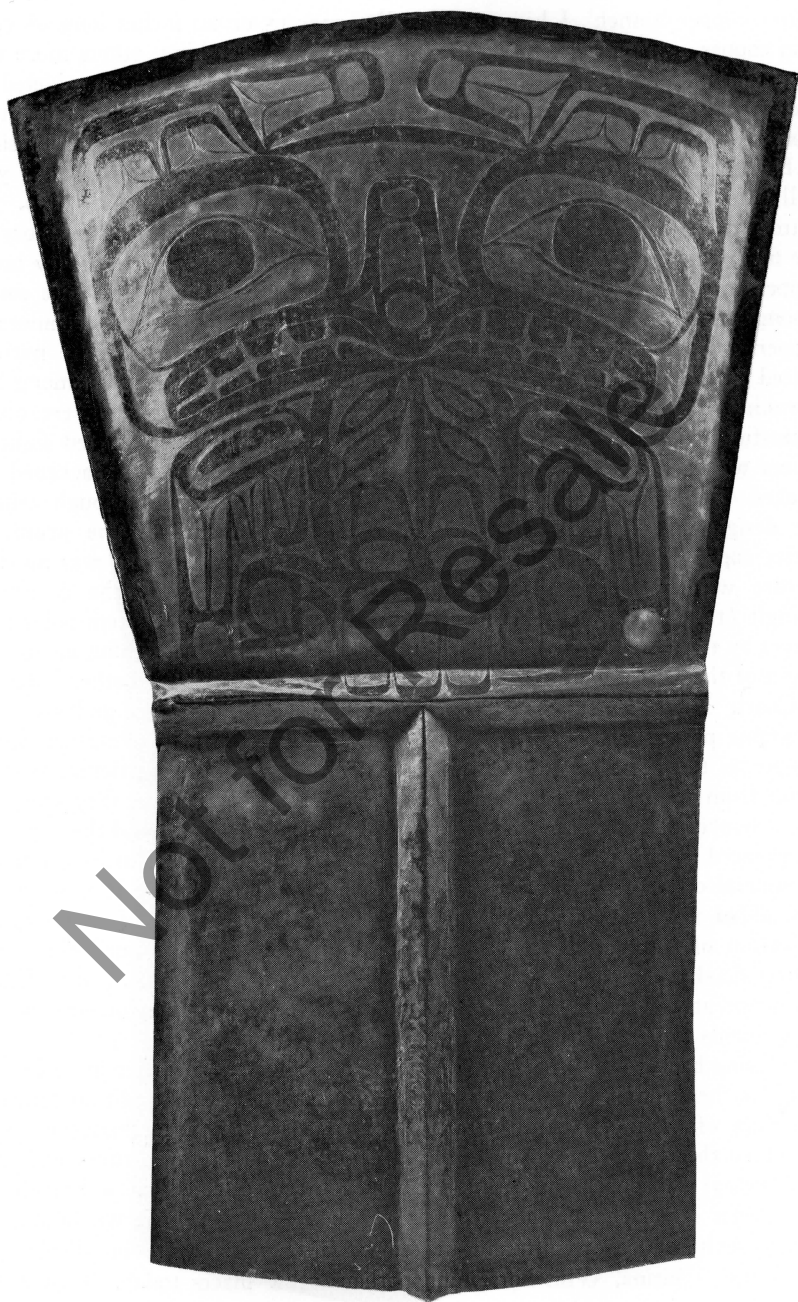
Plate XII. The University Museum, Philadelphia.