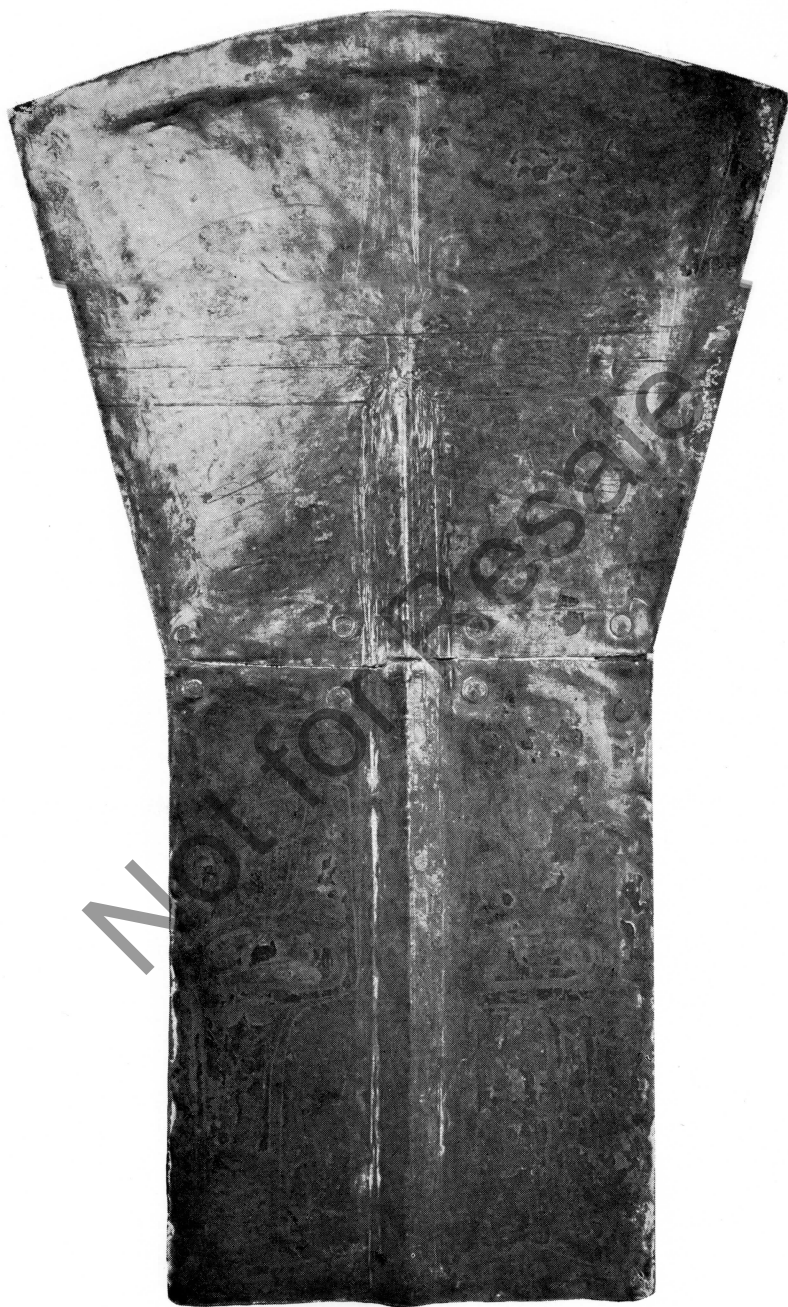
Plate VI. Museum of Anthropology, University of British Columbia.