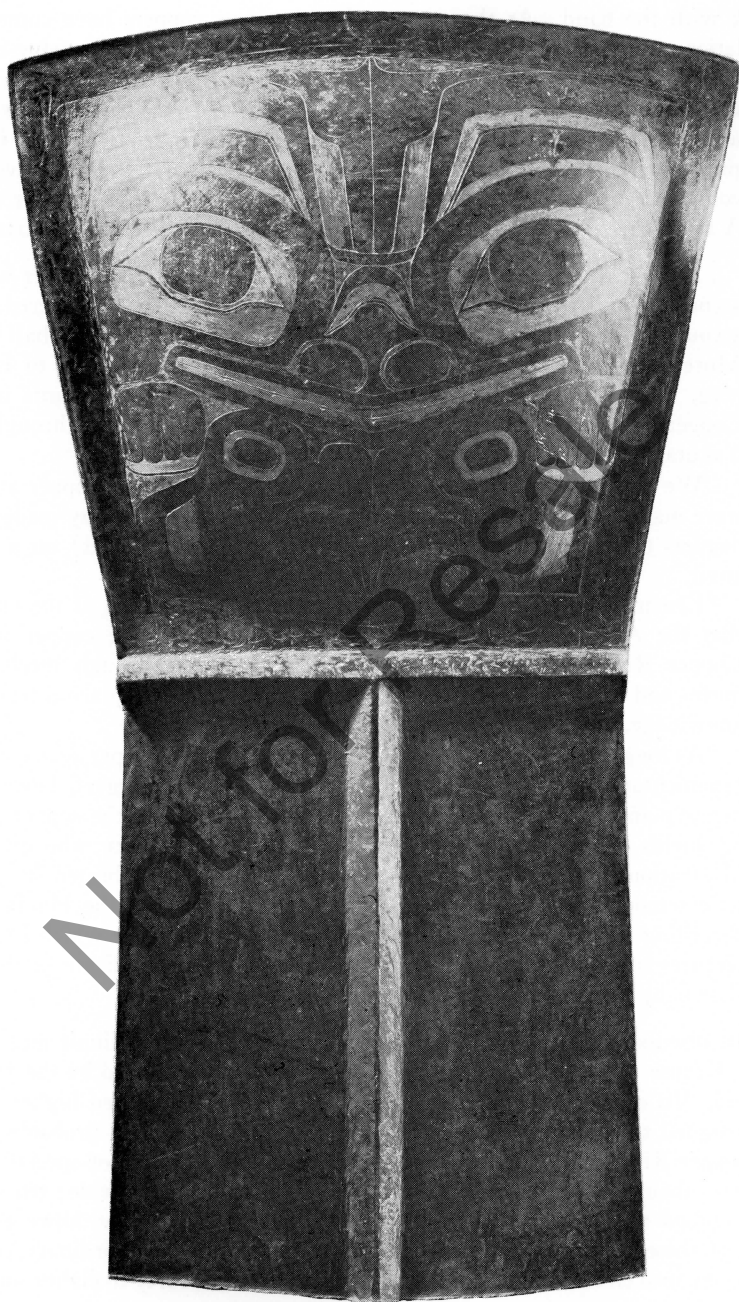
Plate X. Ehem. Staatl. Museum für Völkerkunde, Berlin.