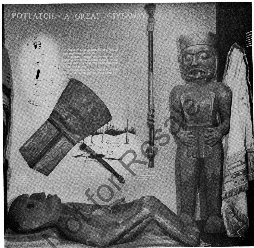
Plate I. Smithsonian Institution Museum of Natural History.

On their own testimony, one can eliminate most of these traders as the manufacturers of the chief's copper, although several no doubt had a hand in its transition from the prototype to its later standardized form. LaPerouse, in discussing iron daggers seen in the hands of the Tlingit at Lituya Bay in 1786 said, "Some of them were also made of copper but they did not appear to prefer them to others. This last metal is common enough among them, they more particularly use it for collars, bracelets and different other ornaments; they also tip the points of their arrows with it. . . ." (LaPerouse, 1798).