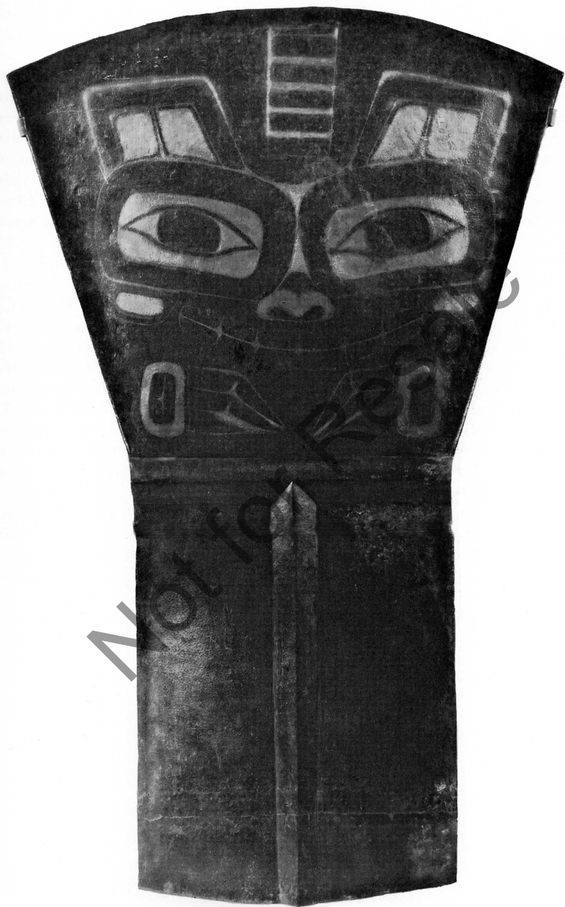
Plate V. University Museum, Philadelphia.