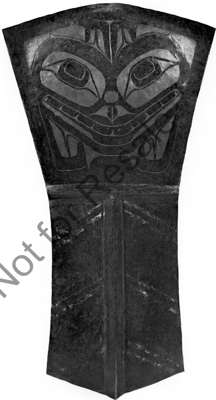
Plate IX. University Museum, Philadelphia.