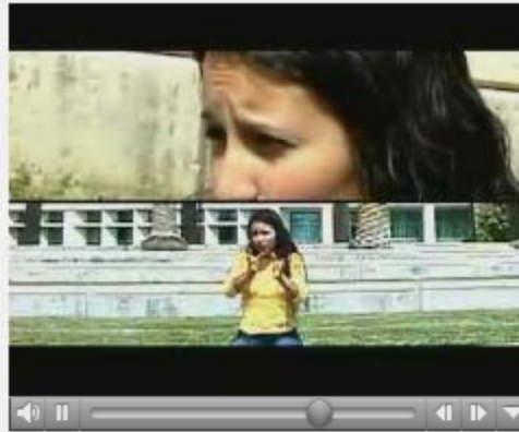
Digital Students @ Analog Schools

http://homepage.mac.com/dvchelo/page1/page3/files/page3-1003-pop.html