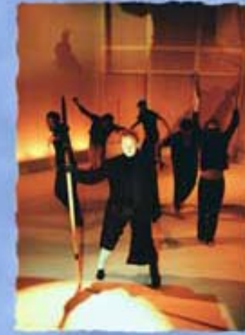
From Perseverance Theatre's " Moby Dick "