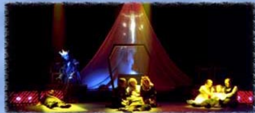
From Theatre UAF's Fall 2001 Productions " Hamlet Dreams " (Left), " Mud " (Right)

Tickets for these events are available at the Lee H. Salisbury Theatre Box Office located at the Great Hall on the University of Alaska Campus. Monday - Friday 12-5 and 2 hours prior to performances.