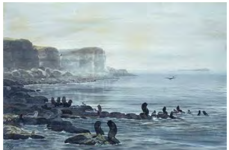
Right: The Reef Point by Henry Wood Elliott, UA482-5.

Artists place smaller and bigger objects in the landscape to give us the illusion of near and far, also called depth . Even though the paper or surface they used is flat, the artist used different sizes of animals to create an illusion that some of them are closer and some are farther away.