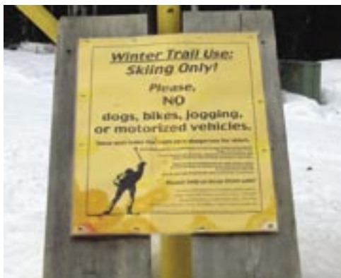
Use restrictions on winter trail.