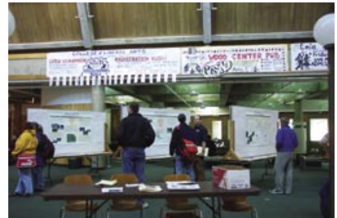
North Campus public meeting at UAF Wood Center, April 5, 2003

Attendees were encouraged to write comments on the posters with Post-it™ notes or give verbal comments to subcommittee members present. In addition, surveys with questions regarding the issues were passed out to those in attendance. The surveys could be returned by campus mail for those not able to complete it during the meeting. In addition, printouts of the posters were available to take with the survey. Surveys, and the printouts of the posters, were also distributed to those not able to attend the public meetings but who were known to have a strong interest in the North Campus.