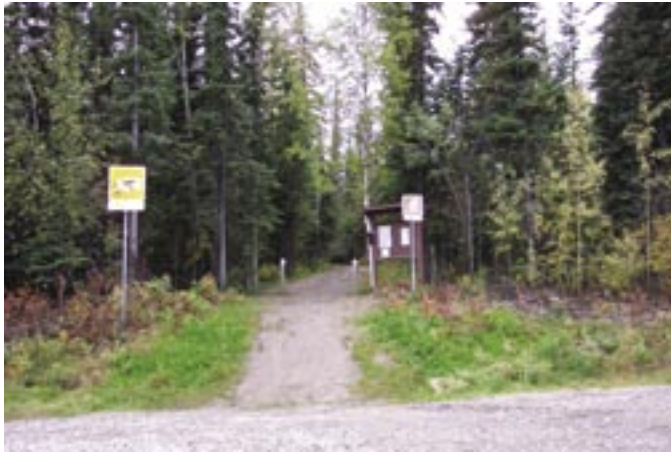
Public access to North Campus and Ballaine Lake.