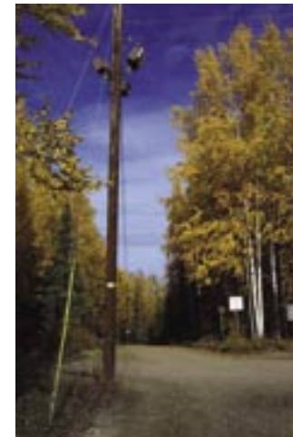
Lights along ski trail.