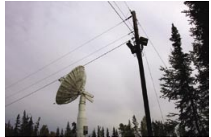
Power lines and Alaska SAR antenna in North Campus area.