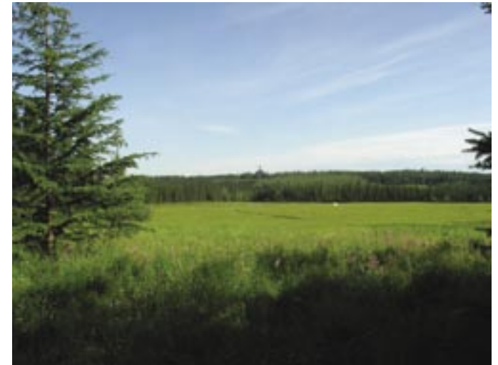
Looking east across the T-field.

The input gathered at the meetings suggests a balanced approach to the management of the NC that preserves many of the uses of the area. The full report from the meetings is found in Appendix G.