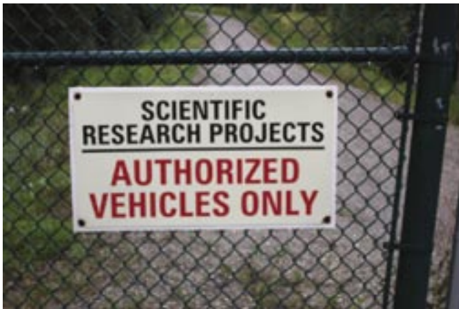
Research area in North Campus.