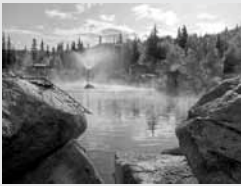
Outdoor Rock Lake