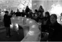
Enjoying the Ice Bar