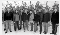
Visit to "Chena Fresh" Greenhouses