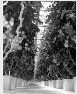
"Chena Fresh" Tomatoes