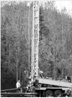
Drilling 3,000 ft Well