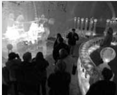
Aurora Ice Museum