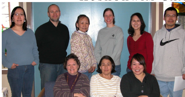
KuC's SES Team (left to right)