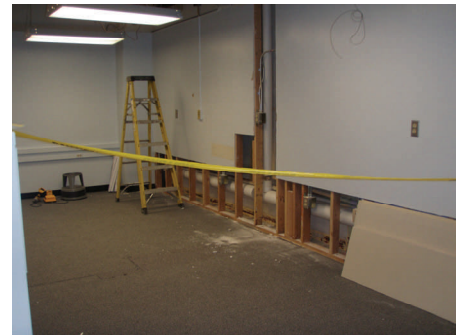
Asbestos removal in the Financial Aid Office

Needless to say there is a lot going on in Signers'! No construction will take place between Sept. 3 & 11. Look for construction to be completed by mid-October.