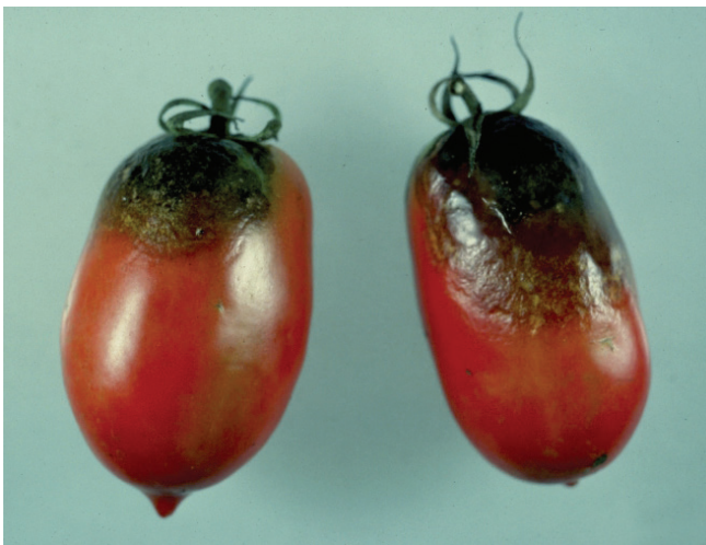
Late blight disease on tomatoes.

If possible use a system of irrigation (such as drip) that will keep the foliage dry. Late blight cannot develop if leaves are dry and humidity is low. If ample garden space is available, space potato plants further apart to increase air circulation around plants. This will help to minimize periods of leaf wetness and reduce chances of late blight infection.