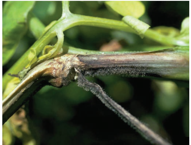
Late blight disease on potato vine.

Photo by Howard F. Schwartz, Colorado State University, Bugwood.org