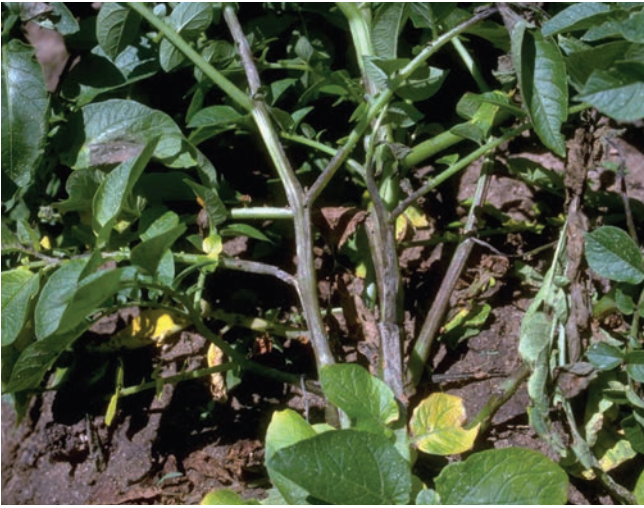
Late blight disease on potato vines.