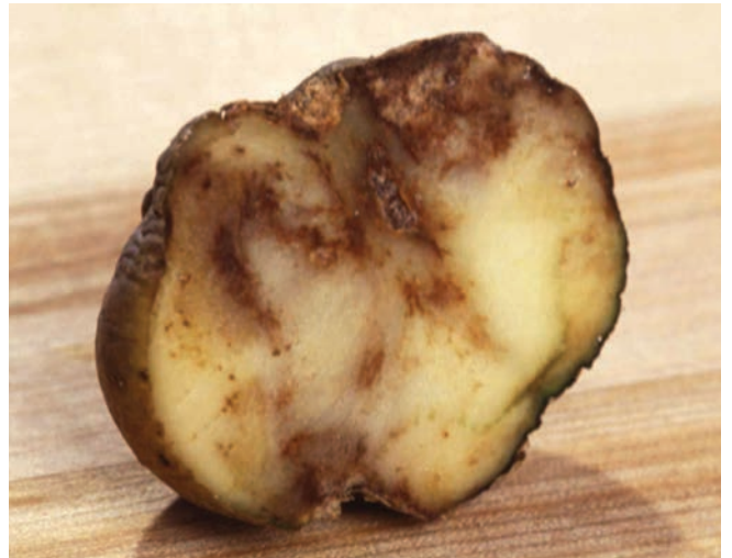
Cross section of potato infected with late blight.