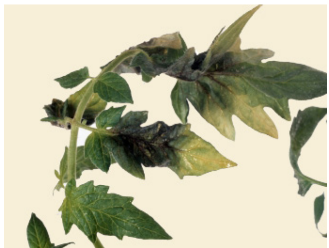
Late blight lesion on tomato leaf.