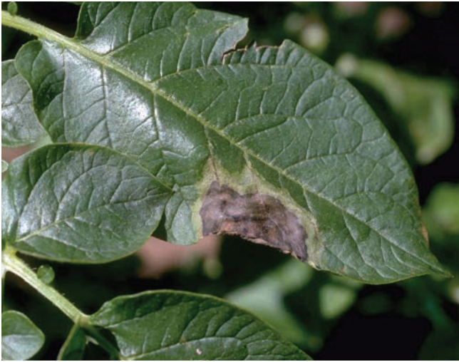
Late blight lesion on potato leaf.