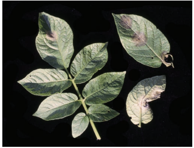
Late blight lesions on potato leaves.