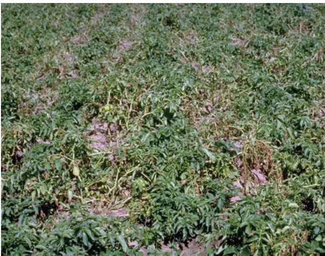
Potato field infected with late blight disease.