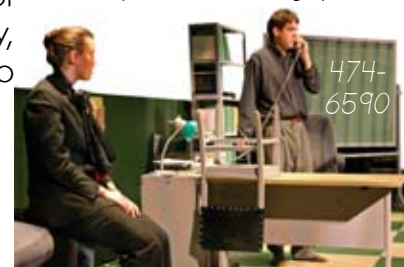
Call an advisor today - operators are standing by!

From the student-directed show "Love Talker"