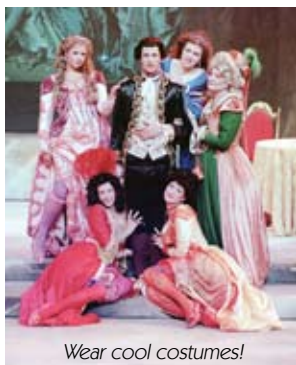
Wear cool costumes!

Our students find it helpful if they can meet with a Theatre Advisor prior to registering for classes. We highly recommend that you speak to someone in the department about your course schedule before registering.