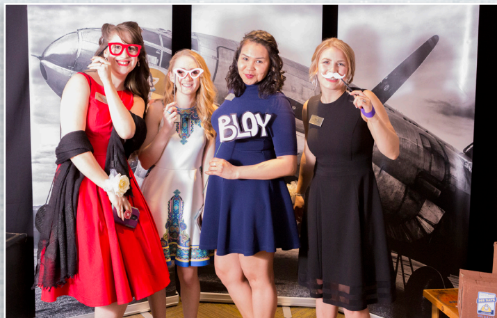
SOM Students at the 2018 Business Leader of the Year dinner and award ceremony