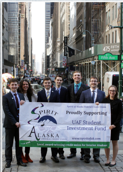
SIF Students on Fifth Avenue