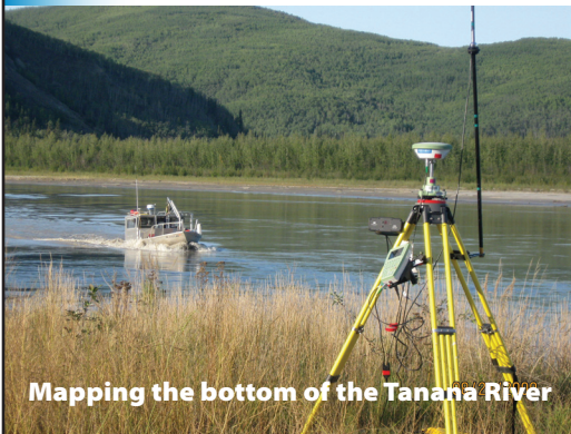
Mapping the bottom of the Tanana River