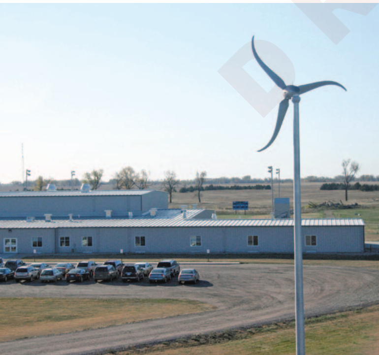
Sanborn Central School in Forestburg, South Dakota, installed a Skystream 3.7 wind turbine as part of Wind Powering America's Wind for Schools project.

The Wind for Schools Project approach is to implement a wind energy training center at state-based universities or colleges. As part of the wind energy curriculum activities, college students assist with installing small wind turbines at primary and secondary schools.