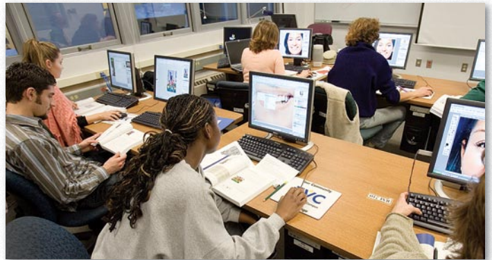
UAF offers hands-on training and small class sizes, with an average student-teacher ratio of 16 to 1.

*Assumes full credit load, double room occupancy and 19 meals/week on campus