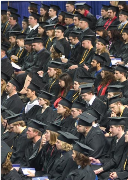
Members of UAF's graduating class of 2004 listen to the keynote address at the commencement ceremony in the Carlson Center.