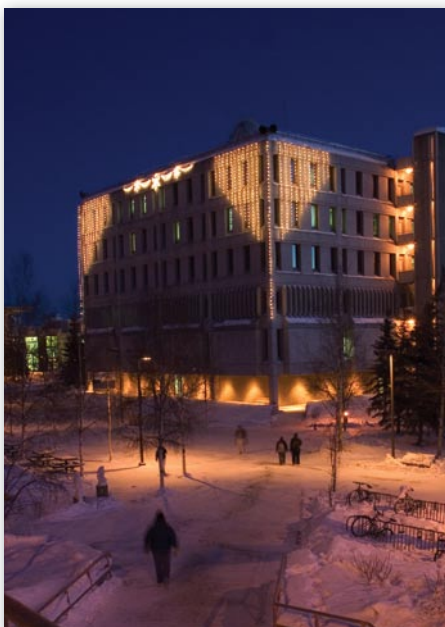
Students make their way past the Gruening Building on a January evening on the Fairbanks campus.