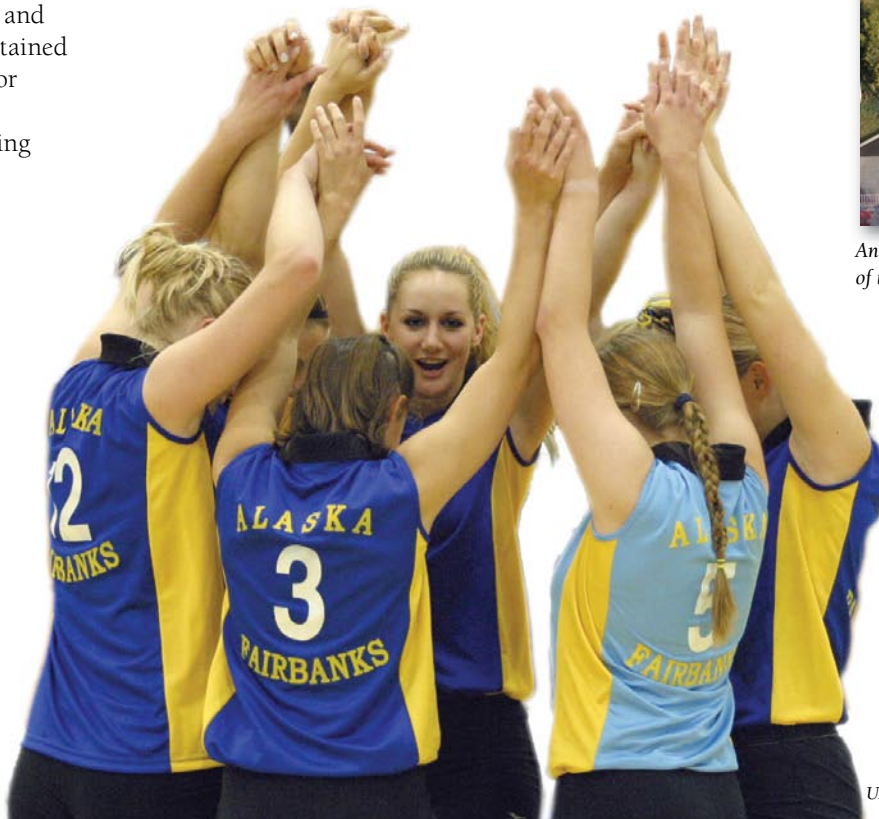
Team spirit and camaraderie are apparent as players celebrate in the huddle before a match against Humboldt State at the Patty Center.