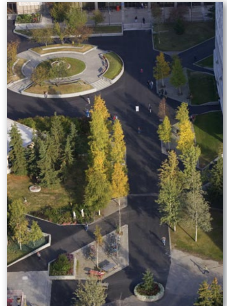
An aerial view shows Constitution Park near the core of the Fairbanks campus.