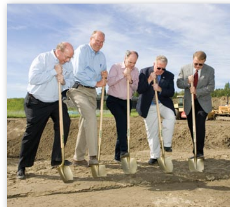
Officials gather for the ground-breaking ceremony of the Cold Climate Housing Research Center's Building and Infrastructure Research and Testing Facility in July 2005.