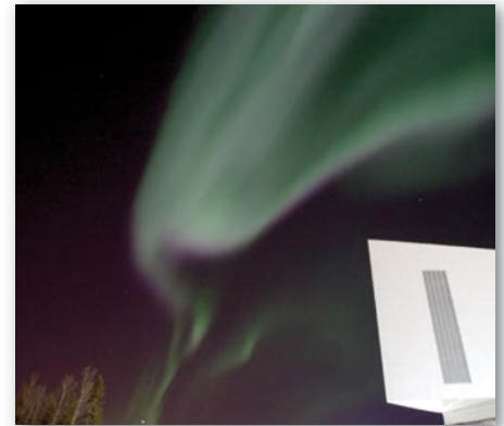
The northern lights glow in the sky above the University of Alaska Museum of the North.