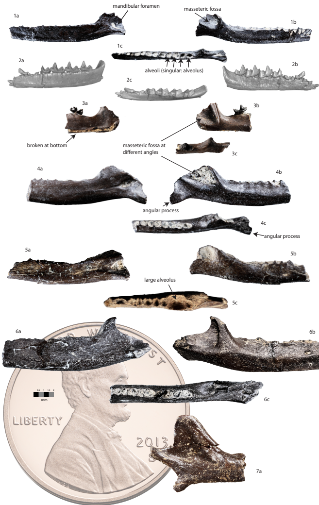
Fig. 3. Jaws of Prince Creek Formation mammals shown in lingual (side facing tongue) (a), labial (side facing out) (b), and occlusal views (view from above) (c). 7a is in labial view. Jaws have been reflected to all be right sides for comparison. 1, UAMES 52404; 2, UAMES 35327, micro CT scans of Unnuakomys hutchisoni , from Eberle et al. 2019; 3, UAMES 41541, Unnuakomys sp; 4, UAMES 53012; 5, UAMES 42840; 6, UAMES 51894; 7a, UAMES 51853, shown in only labial view because still in sediment.