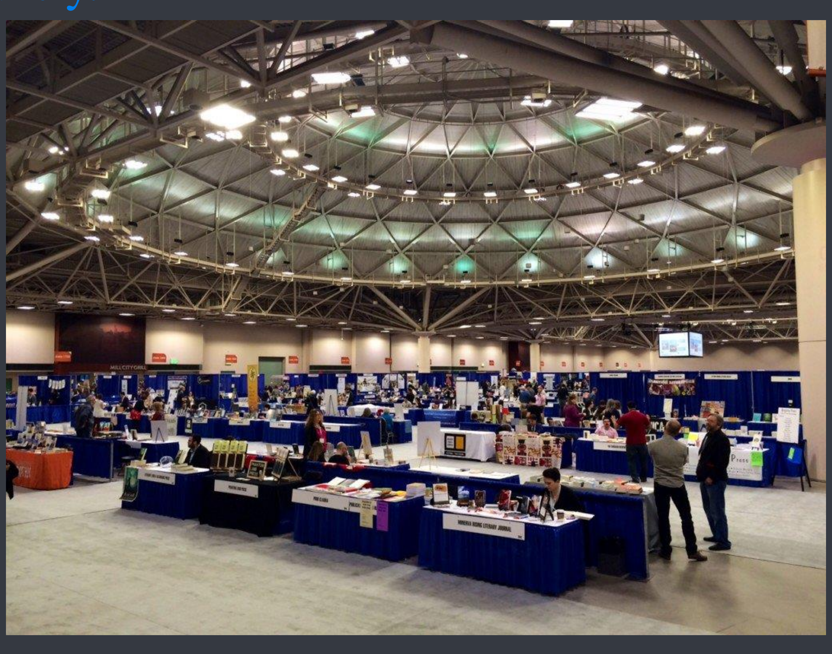
AWP 2022 Bookfair

The mentorship culminated in attending the Associated Writers and Writing Publisher's Conference, the largest conference of its kind in North America. At the conference, we were given the opportunity to speak with current published writers, publishers large and small, and even meet with graduate programs from all over the country.